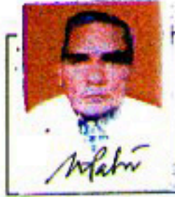
Secretary Nepura Rural Dev. Society